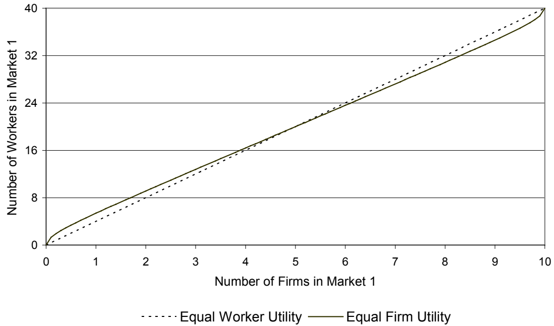
Figure I Equal-Utility Curves in the Labor Market Model: F=10 , L=40 , \sigma = 1 , and \delta = 0.25 .