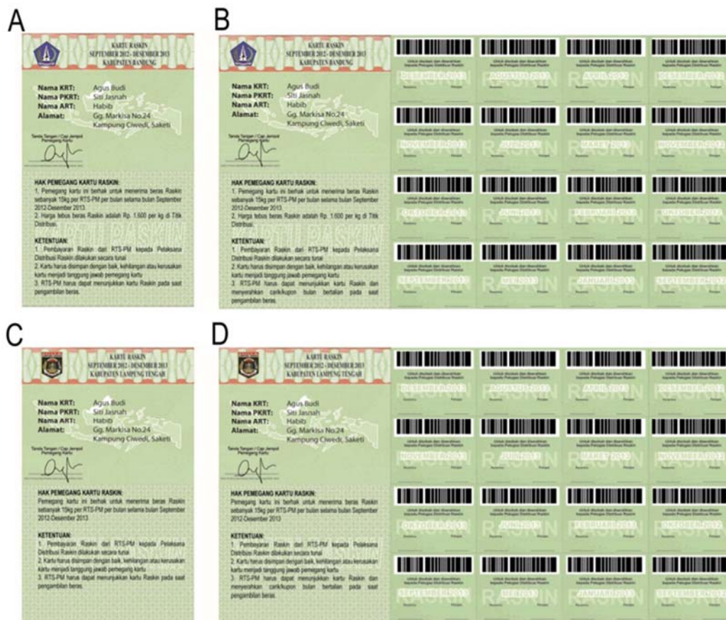
Figure 2: Raskin Cards

Note: Figure 2A shows Raskin cards with the printed price and no coupons. Figure 2B shows Raskin cards with the printed price and the coupons. Figure 2C and 2D show the Raskin cards without the price printed, without and with the coupons respectively.