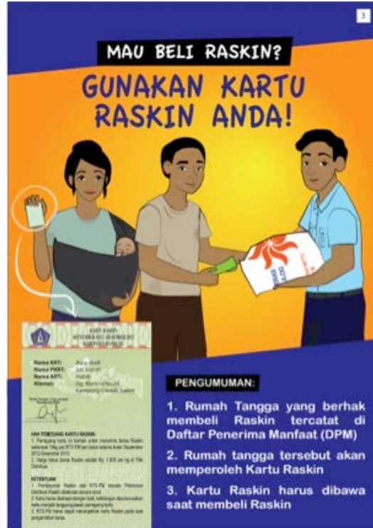
Appendix Figure 1: Public Information Poster

Note: This is an example of the poster used in the public information treatment to inform citizens about the arrival of Raskin cards, as well as how to use them. On the bottom left of the poster is a copy of the card. The picture shows a household showing their Raskin card to an official and purchasing a bag of Raskin (in official packaging). This poster was used in villages assigned to the following combination of subtreatments: cards distributed to all eligible households, price, and no coupons. There were eight variants of the poster to reflect the various combinations of the subtreatments: with and without price, with and without coupons, and distributed to all eligible households or only to the Bottom Decile. The top of the poster can be translated as follows: “Do you want to buy Raskin? Use your Raskin card!” The bottom right of the poster says: “1. Households eligible to purchase Raskin can be found on the official listing (DPM); 2. Households on the official listing will receive Raskin cards; 3. Raskin cards must be used when purchasing Raskin.”