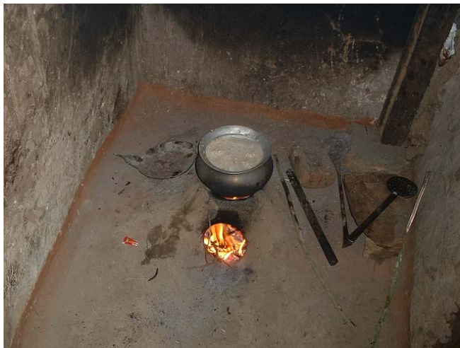
a. Traditional Cooking Stove

Menon (1988) and Saksena, Prasad, Pal, Joshi (1992) have found similar results in India, with reported levels of 20,000 \mu\text{g}/\text{m}^3 or more near the cooking location and with much lower concentrations of these toxins in the rest of the kitchen/other rooms in the household. The global health community has recognized the deficit of information on exposure levels: for example, the 1999 Air Quality Guidelines of the World Health Organization states that “although work on simple exposure indicators urgently needs to be encouraged, realistically it is likely to be some years before sufficient environmental monitoring can be undertaken in most developing countries.” However, continued innovations in the field are allowing for more accurate and reliable data that will allow for more informed policy decisions regarding IAP.