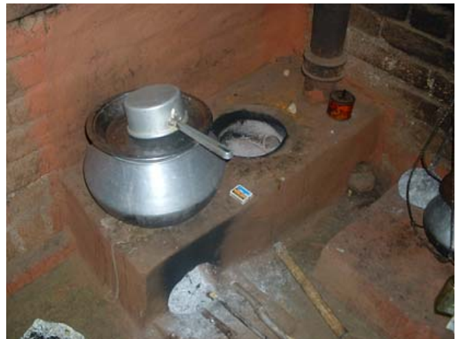
b. Improved Cooking Stove