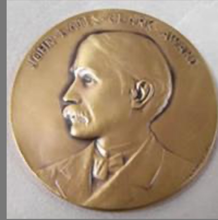
John Bates Clark Medal