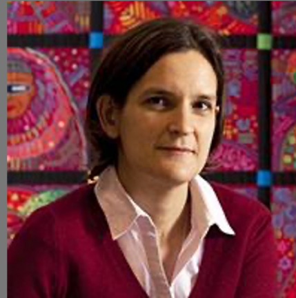
Esther Duflo, 2010