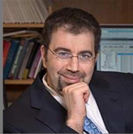
Daron Acemoglu, 2005

Five current faculty members have been awarded the John Bates Clark Medal. Many others are conducting path-breaking and impactful research.