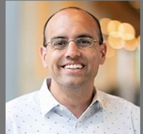
Parag Pathak, 2018