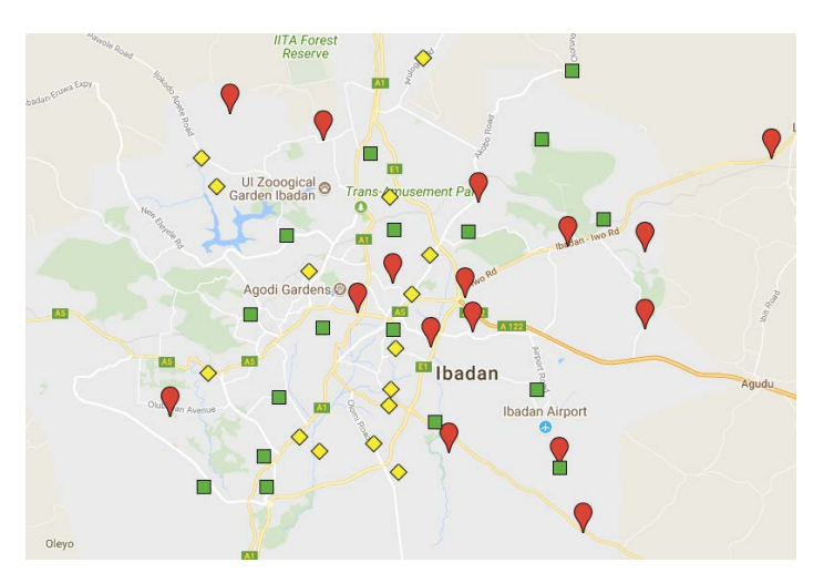
Figure A1: Location of treatment and control centres